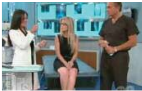
Laughter and Liposuction: Tickle Lipo

She's always looking for new participants - patients who may have an interesting skin finding, or be willing to have a medical or cosmetic treatment filmed for the show, so if you would be a willing participant, let us know! Search "drsandralee" on YouTube.com to see previous segments from the show.