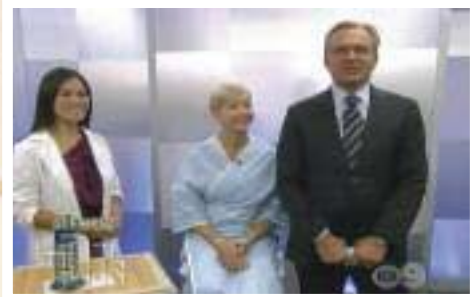
How to Look Great Naked!... With Less Makeup, That Is