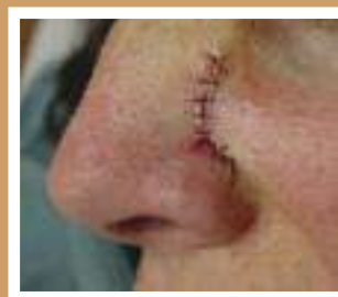
Actual patient during MOHS Treatment