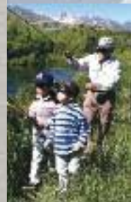
My kids flyfishing with Grandpa