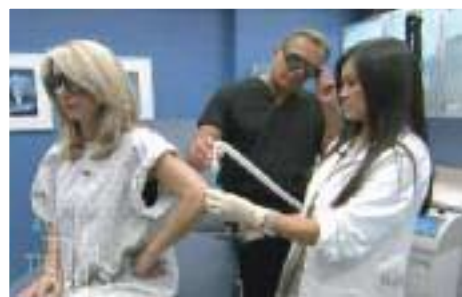
Don't Let Your Elbows Give Away Your Age