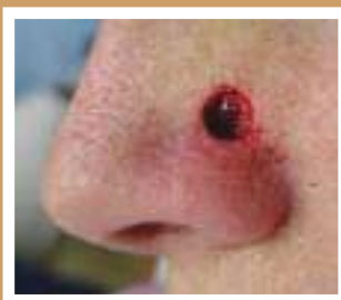
Actual patient before MOHS Treatment

Mohs Surgery is a highly specialized technique that can completely remove skin cancers with as small a scar as possible, and has the lowest cancer recurrence rate of any method to date. The malignant skin is numbed with local anesthetic, and the visible skin cancer is removed. While you wait in our comfortable lounge, we process the tissue that was removed and check it under the microscope to ensure that we have removed the entire skin cancer. If a positive skin cancer margin still remains, we can just take a little more tissue from whatever edge is still positive and then check this under the microscope. Ultimately, as little skin as possible is removed while at the same time ensuring the highest cure rate of any surgical technique to remove skin cancer. Mohs Surgery is the superior method to remove basal cell and squamous cell carcinomas, particularly on the face and neck. You can read more about Mohs Surgery on our website at SkinPS.com