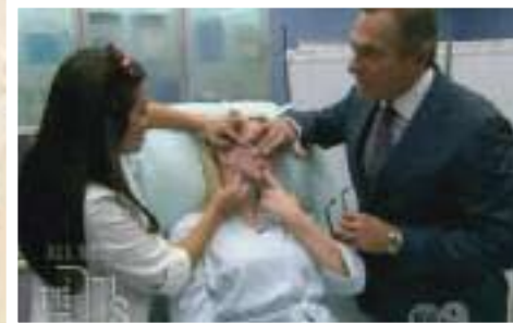
Spring Cleaning: Clear away the cobwebs and get a Lunchtime Buff & Shine