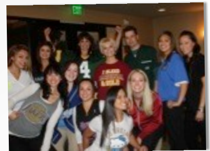
LAST MONDAY, WE DRESSED UP REPRESENTING OUR FAVORITE SPORTS TEAMS!