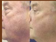
Before & after laser for blood vessels*